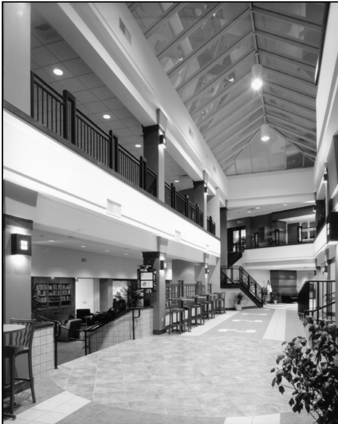
Castagna Concourse in the Brossman Commons

Counseling Services compiles job placement statistics for the most recent Elizabethtown College graduating class. These statistics are available to the general public upon request to the Director of Counseling Services.